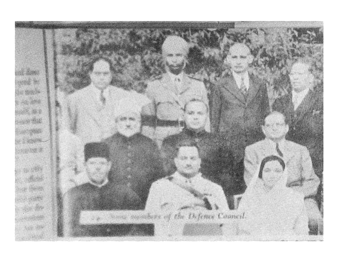
Dr. Ambedkar with some members of the Defence Council of India.